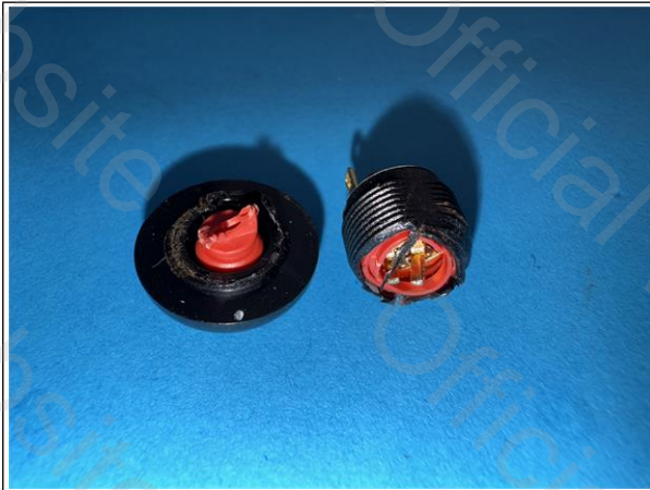
Check close-up after test-Sample A