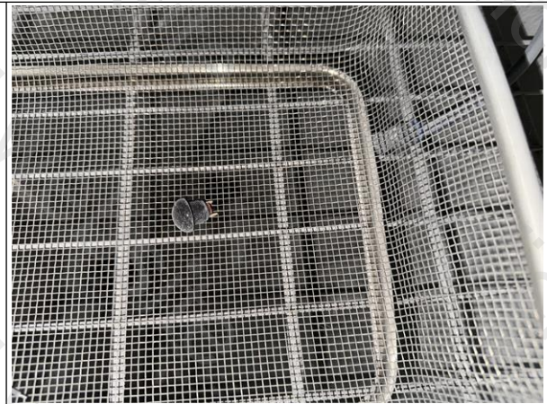
During Test 2-Sample B