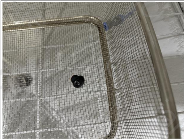
During Test 1-Sample B